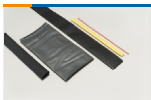
Heat Shrink Tubing(6)